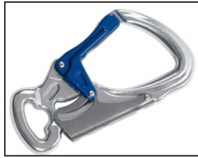
IKV 11 (EN 362:2004)